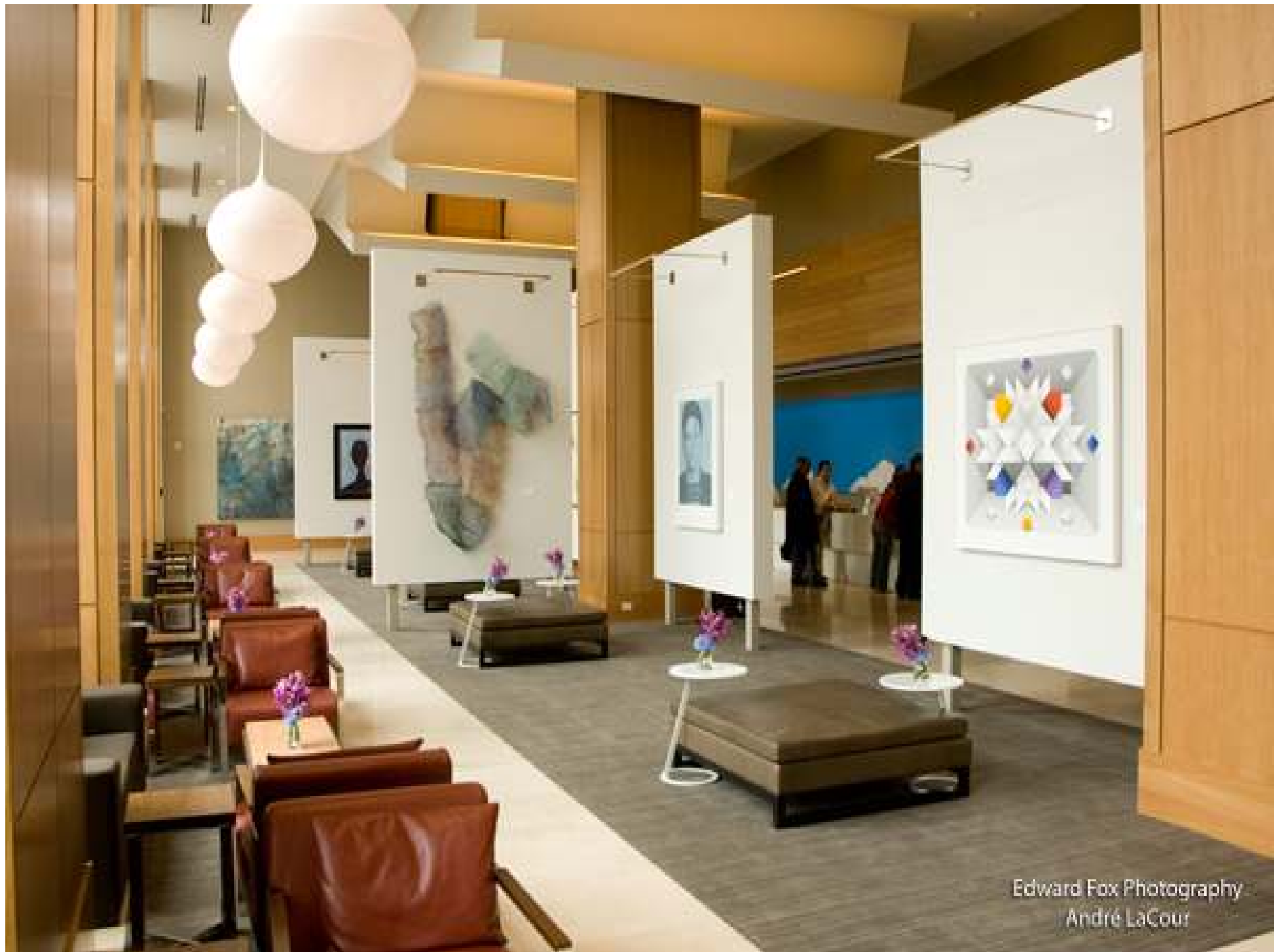
Edward Fox Photography André LaCour