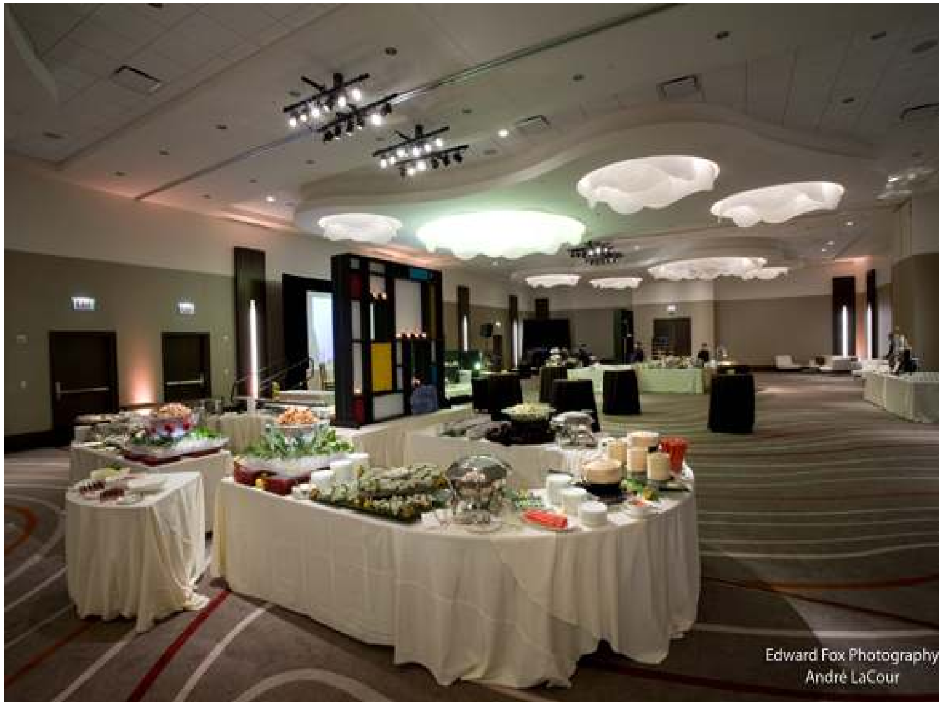
Edward Fox Photography André LaCour