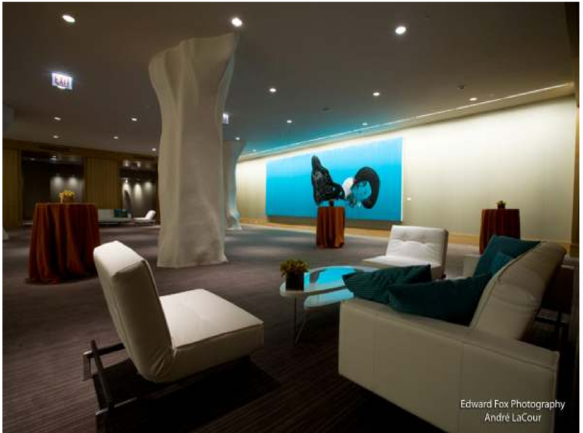
Edward Fox Photography André LaCour